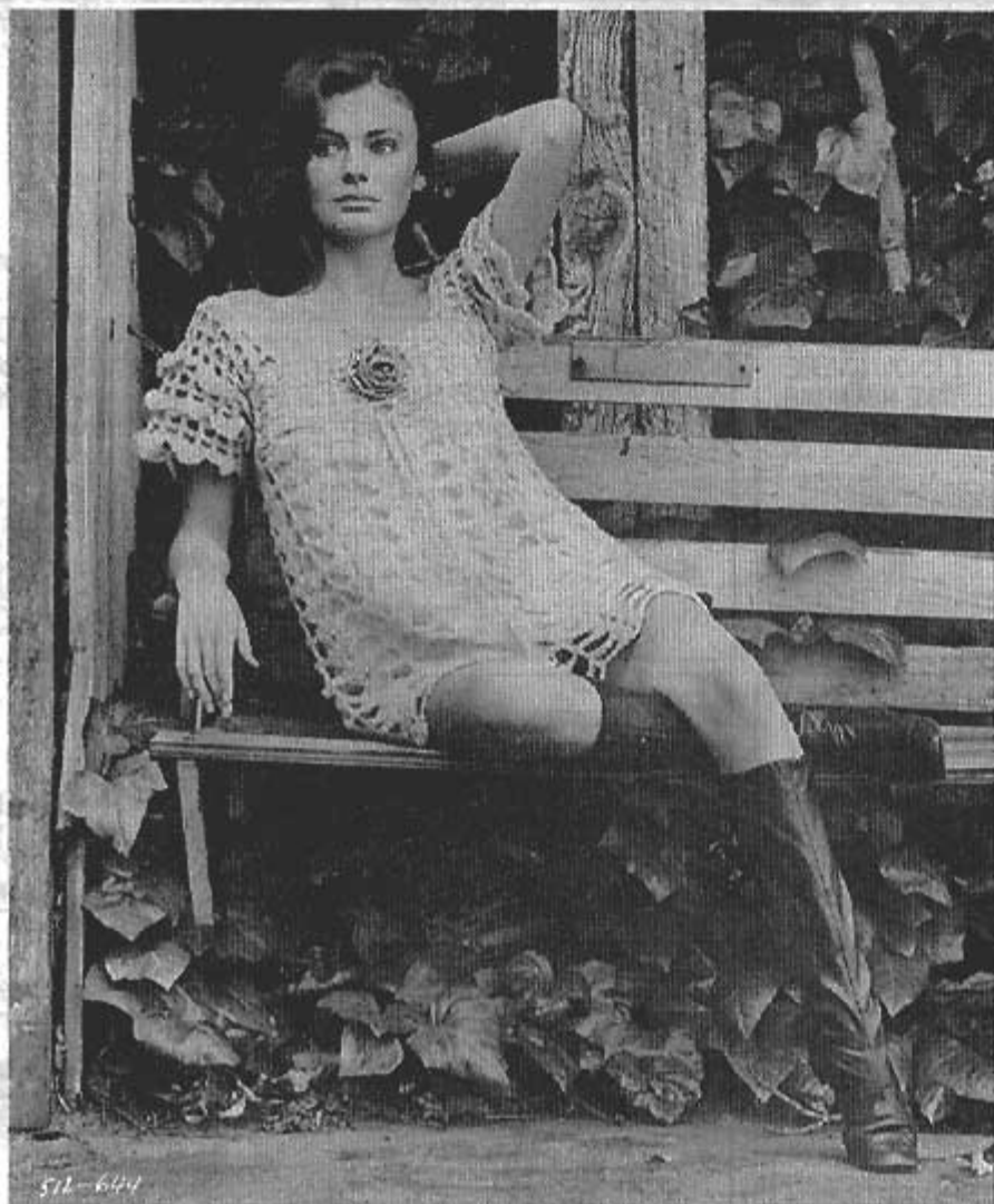
Jacqueline Bisset plays Cathy in the suspense drama "Bullit," also starring Steve McQueen and Robert Vaughn

America's first aircraft carrier served in the Civil War. The G. W. Parke Custis, a remodeled coal barge, carried an observation balloon to spy on Confederate positions near the Potomac River.