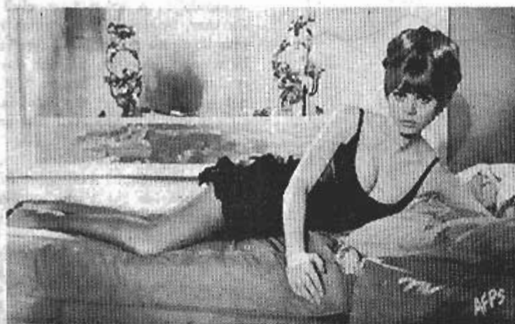
THE SILENT TYPE — Britt Ekland is mighty easy on the eyes in the Warner Bros. picture "The Bobo."